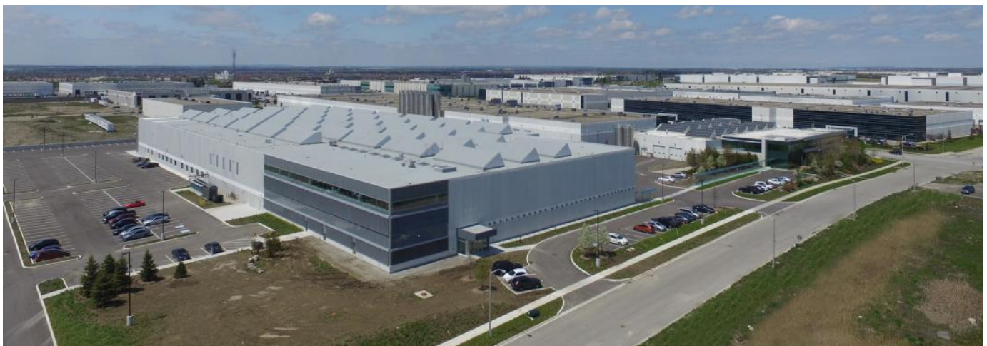
Just-in-time manufacturing plant opened in 2016